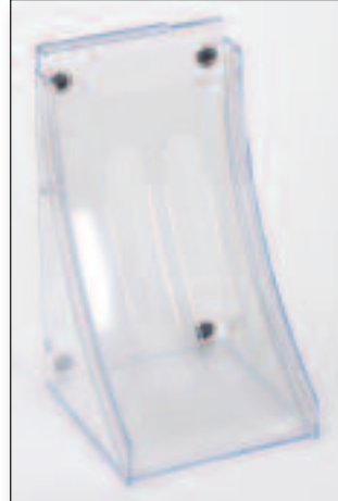
PENDISPCLR PEN DISPENSER