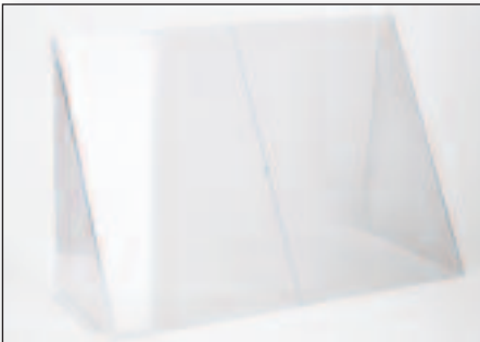
RACINGPOSTHLDRCLR RACING POST HOLDER