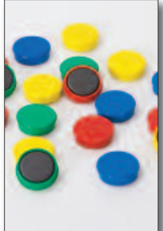
BUTTONMAG BUTTON MAGNET