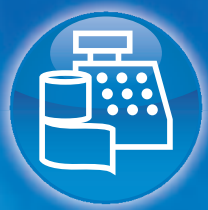
EPOS & Till Rolls