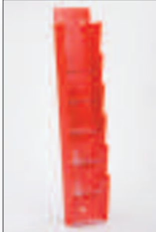
RED6PKTDISP 6 POCKET DISPENSER